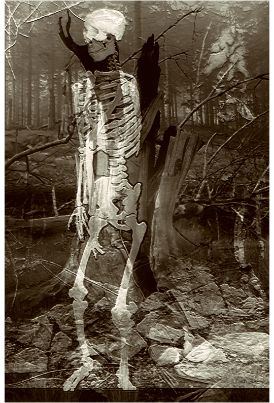
"Gerippe, Mensch, Natur" Abstract Creative Photography

"To create an impact with my art and connect it to something as meaningful as the conservation of what is left of our planet is as important as creating the expressive representation to being with."