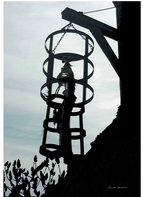
"Folterung" Abstract Creative Photography