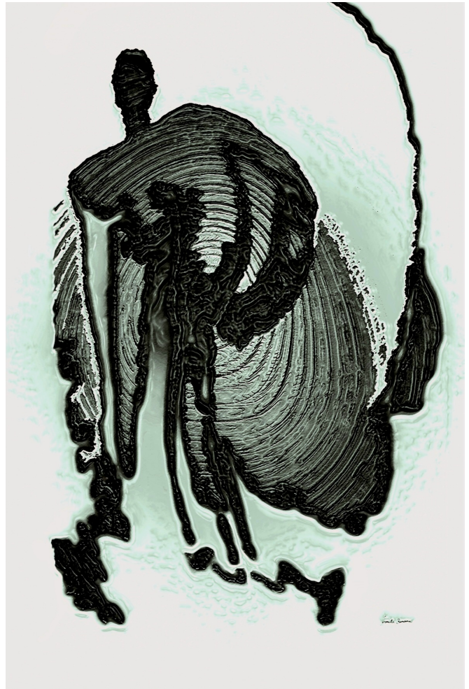
"Adam and the Leave" 2019, Abstract Creative Photography, 29.5" X 19.7"