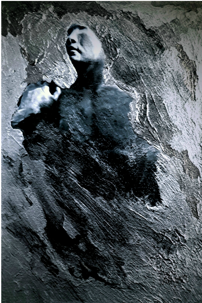
"The Art Smith" 2018, Painting, Metallic - Acrylic on Photography, 29.5" X 19.7"